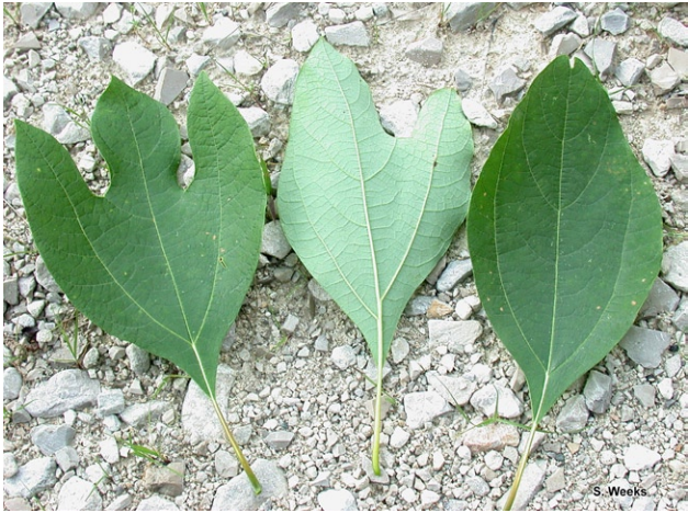
Figure 11. Sassafras leaves

mainly planted in the western states for use as shelter belts and wind breaks.