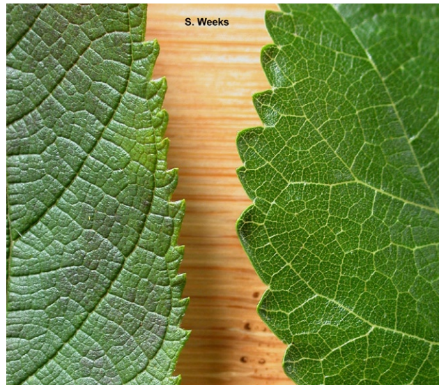
Figure 3. Typical leaf margins, red mulberry-L, white mulberry-R

Buds. Buds are usually distinctly different in the two species and are available for at least