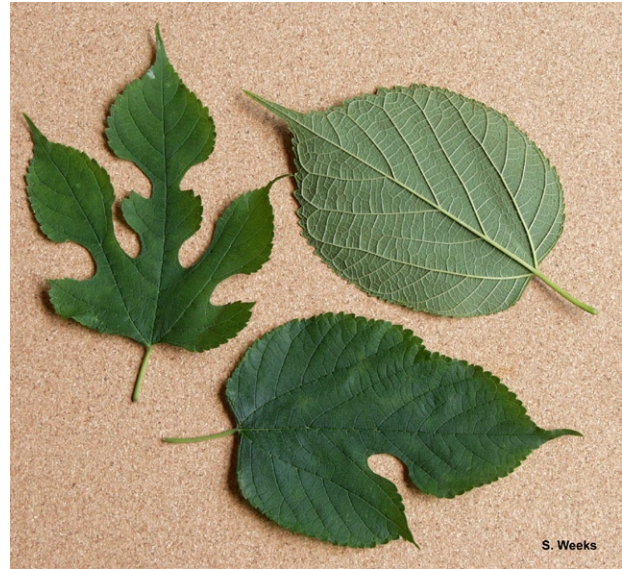
Figure 1. Red mulberry

Red mulberry (Figure 1), our only native mulberry, is a tree often unnoticed, and commonly misidentified as white mulberry,