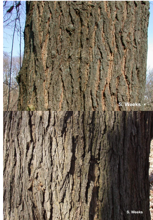
Figure 7. White mulberry-Top, Red mulberry-Bottom

Bark. Red mulberry bark (Figure 7) is grayish with flattened, scaly ridges. If inner bark is exposed, it tends to be tan-colored. White mulberry bark has thick, braiding ridges that are tannish-brown. The yellowish inner bark is nearly always exposed between ridges.