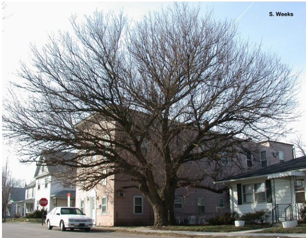
Figure 8. White mulberry form

Form. Open grown red mulberry trees are very uncommon, but they tend to have short trunks with large, low, spreading limbs – making fruit picking a breeze! White mulberry (Figure 8) is often a small, multi-branched tree that commonly has “witches-brooms” throughout its crown. White mulberry probably occurs in every county of Indiana, whereas red mulberry is difficult to find north of Indianapolis, likely because of a loss of woodland habitats and hybridization with the much more abundant white mulberry.