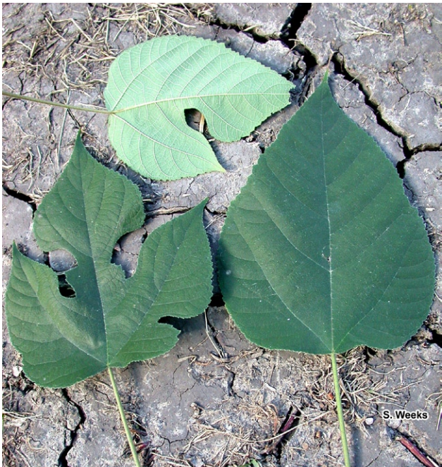
Figure 12. Paper mulberry

Paper mulberry ( Broussonetia papyrifera ) (Figure 12) is native to China and Japan, and has been planted irregularly in the southern states. It is hardy only as far north as extreme southern Indiana (Zone 6b). It is a member of the mulberry family (Moraceae), and has variable-shaped leaves that are rough to the touch. Notice its long leaf petioles compared to the Morus species. Its fruits are small, rounded “balls” attached directly to the twig. In shape, they look like a cross between a mulberry and Osage-orange fruit.