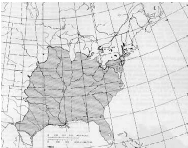
Figure 9. Natural range of red mulberry.

Form. Open grown red mulberry trees are very uncommon, but they tend to have short trunks with large, low, spreading limbs – making fruit picking a breeze! White mulberry (Figure 8) is often a small, multi-branched tree that commonly has “witches-brooms” throughout its crown. White mulberry probably occurs in every county of Indiana, whereas red mulberry is difficult to find north of Indianapolis, likely because of a loss of woodland habitats and hybridization with the much more abundant white mulberry.