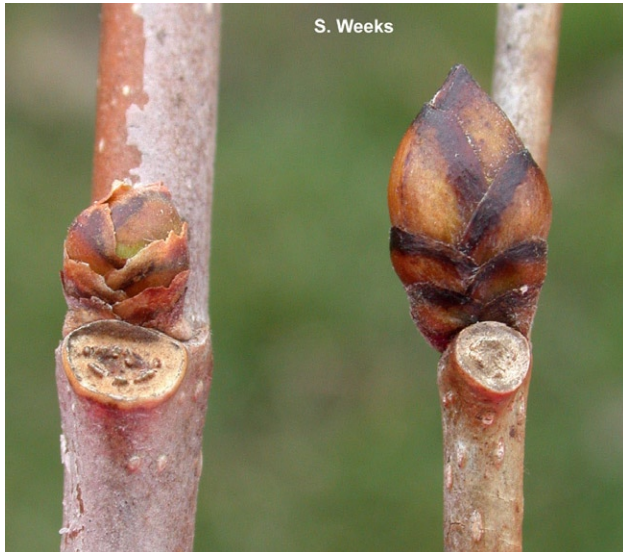
Figure 5. White mulberry-L, red mulberry-R

Fruit. The fruit of mulberry (Figure 6), technically known as a drupe; it is juicy, sweet, flavorful, and a delight of summer. It is relished by many birds and mammals, including humans. Red mulberry fruit is generally larger (>1 inch)