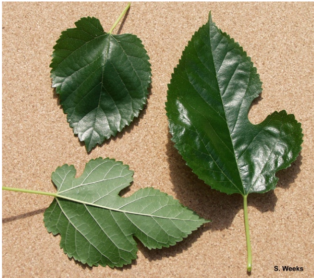
Figure 2. White mulberry

that it is white, but that is rarely true. Most often it is red to purple when fully ripe.