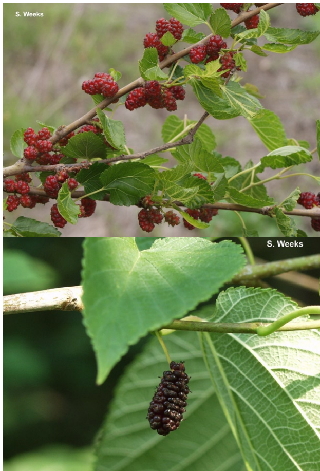
Figure 6. White mulberry-Top, red mulberry-Bottom

Fruit. The fruit of mulberry (Figure 6), technically known as a drupe; it is juicy, sweet, flavorful, and a delight of summer. It is relished by many birds and mammals, including humans. Red mulberry fruit is generally larger (>1 inch)