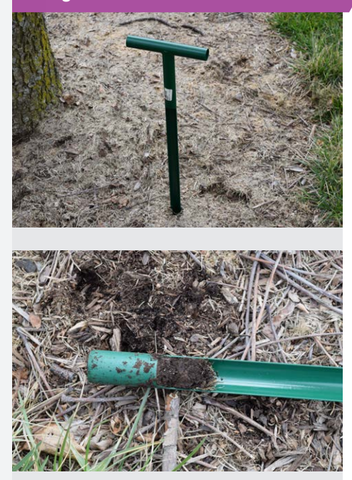
You can use a soil probe to obtain soil from multiple locations around the landscape bed or garden. Take samples to a depth of 6-8 inches.