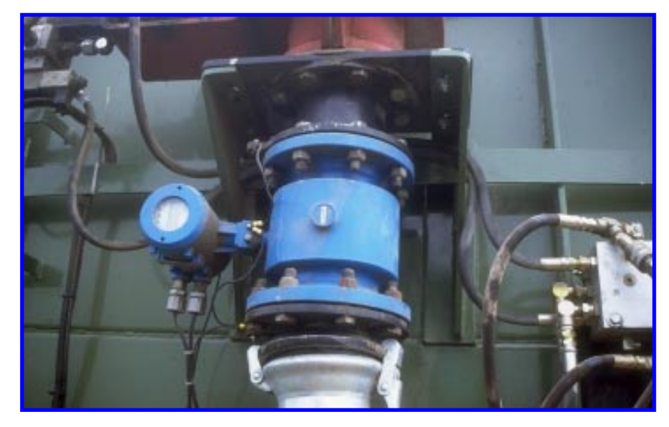
Figure 2. Electromagnetic flowmeter installed on a manure applicator.

As with all land-based site-specific farming operations, it is important to have an accurate measure of travel speed during manure application. Radar and ultrasonic speed sensors have proven successful in operations such as fertilizer application and crop yield monitoring. Both radar and ultrasonic sensors are preferable to wheel- or transmission-mounted sensors because neither is affected by changing vehicle weight or wheel slip. A GPS receiver can also provide travel speed data if the applicator is so equipped.