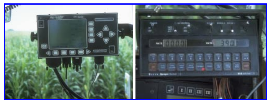
Figure 3. Site-specific application system display unit (on the left) and an electronic application controller.

Site-specific application location can be determined using GPS hardware and software. Site-specific manure application systems can be assembled to collect position, travel speed, and flow rate data on a continuous basis. Such systems include a GPS receiver, flow sensor, and travel speed sensor connected to an in-cab display unit through an electronic application controller (Figure 3).