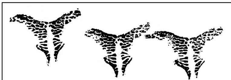
Figure 9: Three acceptable nose prints of the same sheep, illustrating similar lines and dotted patterns.