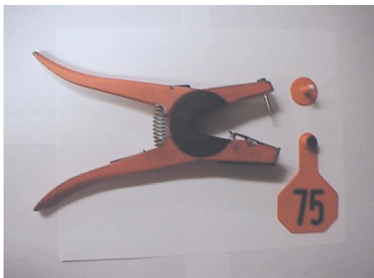
Figure 3: Ear tagging pliers and plastic, pre-numbered tag.

Each notch, with the exception of the 81-notch, can only have two notches for any single number. For example, a pig identified as 28-3 would be the third pig from the twenty-eighth litter. This pig would have one notch each at the 27 and 1 position on the right ear, and one notch at the 3 position on the left ear. A pig identified as 18-2 would have two notches each at the 9 and 1 positions on the appropriate ear.