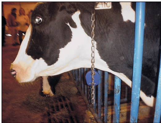
Figure 8: Dairy cow with a neck chain and corresponding numbered tag.

With each of these electronic ID methods, a scanner interprets the radio signal from the tag or implant as a numerical code, which brings up a corresponding computer file for that particular animal. Thus, a production history can be located quickly by scanning the electronic chip. Electronic identification can be used to automatically dispense feed to animals,