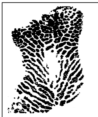
Figure 10: Acceptable beef nose print.

or with a halter, and placing a minimal amount of ink on the animal's dried nose. The ink is then transferred to an index card, supported by a wooden block or stiff backing, by pressing the card against the animal's nose. If the prints are readable, they should be allowed to dry, and clearly identified with the owner's name and the animal's identification number. Problems associated with nose printing include: the use of too much ink, a build-up of moisture on the animal's nose, and not holding the animal still, which can result in a smeared, unreadable print.