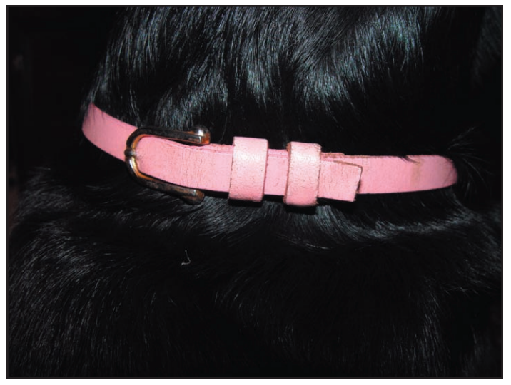
Leather flat buckle collar.

A head collar fits around the dog's muzzle and the neck. There is a nose loop and a neck strap, and is an excellent solution for a dog that pulls when it is being lead, or for a large dog with a small child. The head collar may look