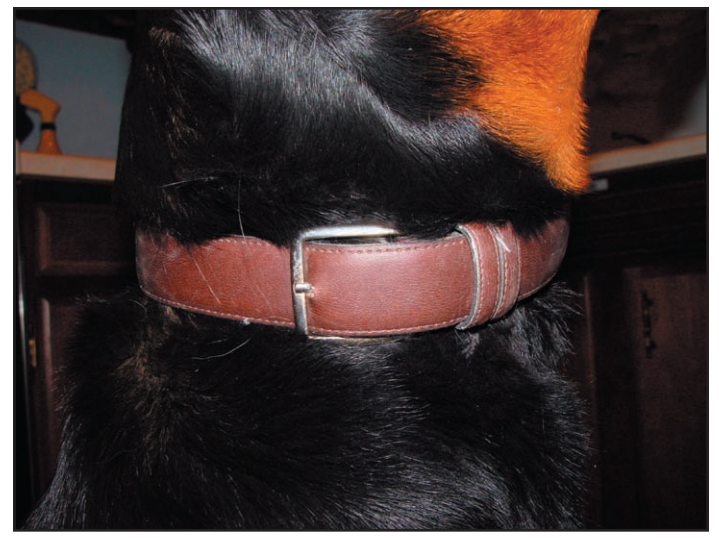
Leather flat buckle collar.

A harness will not place pressure on the dog's throat because it is fits around the dog's chest and ribcage. Harnesses are also more difficult for a dog to slip out of than a flat buckle collar. The harness should be snug, but still allow two fingers to slip easily beneath it. Harness size is determined by the size of the dog's girth, the widest part of the ribcage just behind the elbows. To find your dog's harness size, simply measure the size around your dog's girth and add about two inches. Harnesses usually fasten with a buckle, so the size is adjustable. The harness package will list the size range in inches.