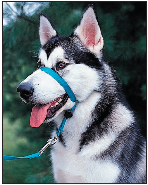
Gentle Leader® head collar.

Nylon collars are less likely to break or stretch than leather collars. They can be cleaned by simply using soap and water. A properly fitted flat buckle collar will be somewhat snug; however, you should be able to easily fit two fingers between your pet's neck and the collar. A