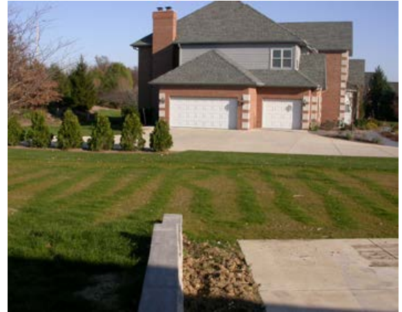
Figure 6. Uniform fertilizer application is an essential part of implementing a healthy annual fertilizer program. Using a narrow drop spreader to apply granular products across large areas may prove difficult and result in misapplication and poor turf nutrient utilization.

Shaded grasses grow more slowly, so they may require up to 50 percent less annual N than turf grown in full sun. The turfgrass species of choice for shaded areas are the fine-leaf fescues such as creeping red fescue. This grass will persist in moderate shade, but if you apply too much N,