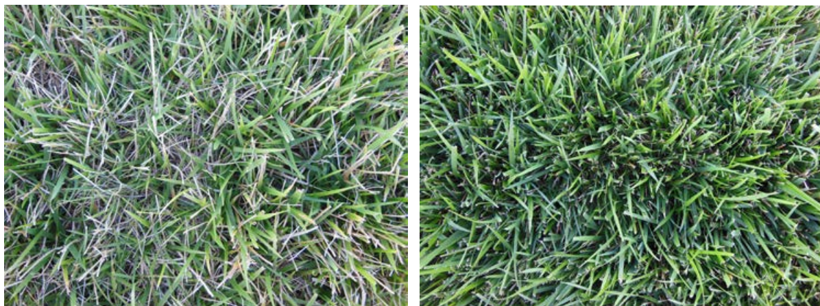
Figure 2. The turf on the left has not been fertilized for three years and is malnourished. The leaves are yellowing (chlorotic) and the soil is becoming visible near the canopy base. The turf on the right has been regularly fertilized. It has a pleasing green color and much higher shoot density to resist pests.

If you're not sure what kind of grass you have, or what type of grass to plant, the turfgrass identification and lawn selector tools can help: