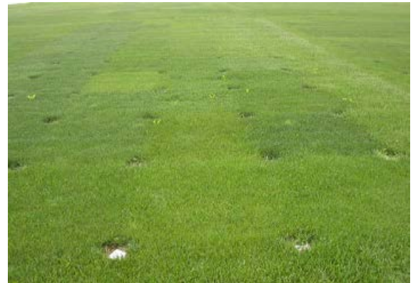
Figure 3. The green color of many turf species can vary considerably. If you desire a dark green lawn, choose darker green cultivars or varieties.

If your primary goal is a very dark green lawn, consider selecting and planting grass cultivars that are genetically more dark green (Figure 3).