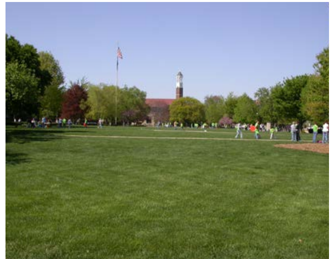
Figure 1. Proper seasonal fertilization is essential to sustaining turf health and appearance.

By contrast, warm-season grasses perform best in warmer climates and are less common in the Midwest, except near the Ohio River valley. These grasses thrive and grow when many cool-season varieties go dormant. Zoysiagrass and bermudagrass are common warm-season species.