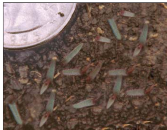
Figure 3. Bermudagrass seedlings

five to eight weeks after seeding or sprigging.