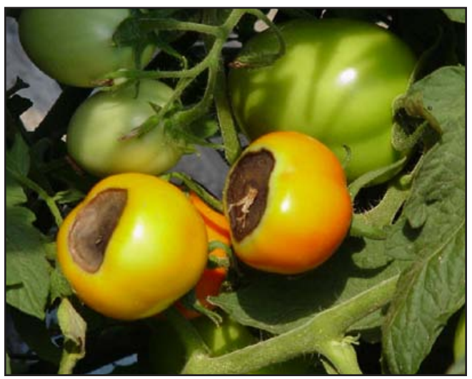
Figure 4 . Blossom-end rot is a noninfectious disorder that causes leather-like lesions on the blossom end of tomatoes. The disorder is caused by calcium deficiency.