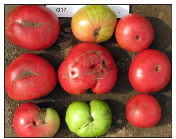
Figure 5 . Catfacing of tomatoes is often associated with cold weather during flowering.

This disorder, which is also noninfectious, can be recognized by the malformed tomato fruit it causes (Figure 5). Catfacing often occurs when the flower buds were exposed to cold. Heirloom varieties exhibit a high proportion of fruit with catfacing; thus, catfacing may not detract from the marketability of these varieties. Variety selection is the most practical way to limit this problem — larger varieties tend to be more prone to catfacing.