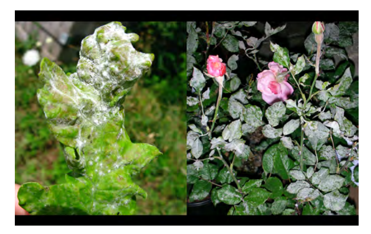
Figure 2. Powdery mildew infection can cause deformity and distortion on leaves and stems.