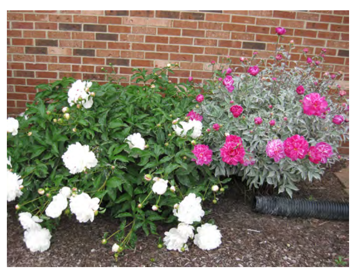
Figure 8. Many plants are selected or bred for powdery mildew resistance.

Powdery mildew seldom warrants chemical control in the home landscape and is more often an issue of nursery and greenhouse production. When addition disease control in desired, materials with low environmental impact, such as horticultural oils or neem oil can prevent infection when applied to green tissue on the plant. Such applications can remain effective for