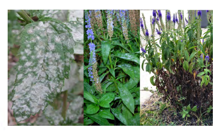
Figure 5. Veronica is just one plant species that produces a diversity of symptom responses to powdery mildew infection.

A variety of microscopically distinct fungi cause powdery mildew, so while the white growth covering different plants may look the same to the naked eye, the fungi causing powdery mildew on one plant are usually microscopically and biologically distinct from those on another plant (Fig. 6). In the Midwest, powdery mildews frequently infect azalea, buckeye, lilac, rose, tulip-tree,