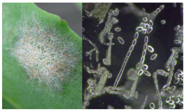
Figure 7. Closeup of powdery mildew infection.

When selecting new plants, choose those that have powdery mildew resistance (Fig. 8). There are many powdery mildew resistant varieties of trees, shrubs, perennial and annual plants. See 'Disease Resistant Annuals and Perennials in the Landscape'. When