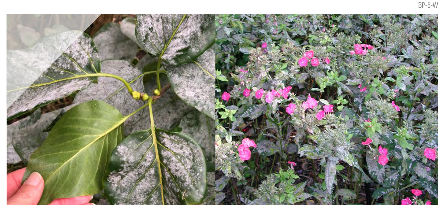
Figure 1. Powdery mildew is readily diagnosed by the white, powdery coating on the leaf surface.