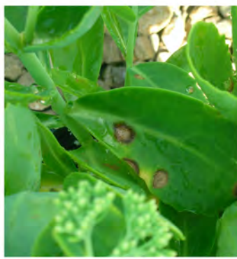
Figure 3. Powdery may present without the characteristic 'powdery' coating, making diagnosis difficult. These sedum were later confirmed to be infected by powdery mildew.