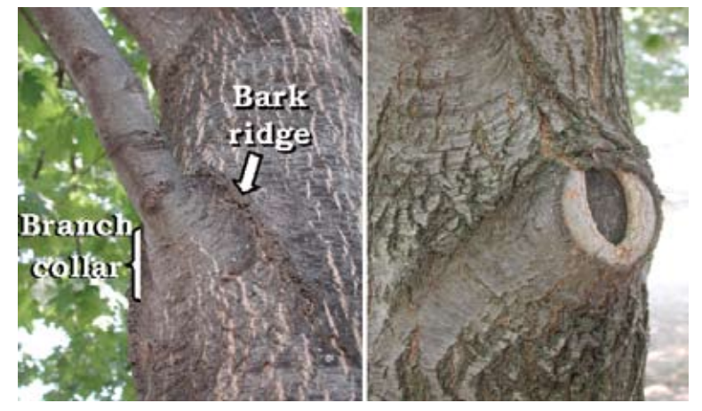
Figure 2. The branch collar and bark ridge are very apparent on this northern red oak. The branch collar (left) is the swollen area at the base of the branch where it attaches to the trunk. It is formed by overlapping and deflected branch and trunk wood. Within the branch collar, a branch protection zone forms to prevent decay of the trunk. The bark ridge is a raised area of bark at the point where the branch attaches to the trunk. A properly pruned large branch one-year later (right). Note that the branch collar is intact and the healthy ring of callus surrounding the cut.

Pruning to develop a single stem can begin when trees are 2-years-old. Young trees 1- to 6-year-old are most commonly pruned in late winter, as close to bud break as practical, so that the pruning cuts will be overgrown rapidly with the onset of active growth in the spring. Older trees may be pruned in the summer or when they are dormant.