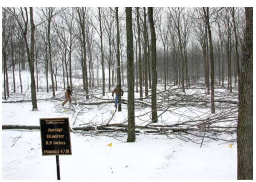
Figure 6. The second thinning of a 21 year-old pure walnut plantation on a moderately good site. The density of the plantation has been reduced to about 175 trees per acre from an original density of 302 per acre (planted at 12-foot × 12-foot spacing).