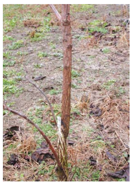
Figure 5. This seedling suffered deer browse during its first year in the plantation. Rather than selecting a single central leader prior to the second growing season from among the many side limbs, it was coppiced below the multiple stems. The remnant of last year's trunk (painted white) shows the vigor and straightness of the new leader that has more than doubled the tree's diameter.

A high coppice can be used to rescue young trees with form defects. Trees may be pruned back to a bud or a point just below where the crookedness or damage is found (Fig. 5). Side branches below this point should be removed or subordinated to encourage the growth of a new, dominant leader. Multiple stems will often form as the result of a high coppice and follow-up pruning is essential if another fork is to be avoided.