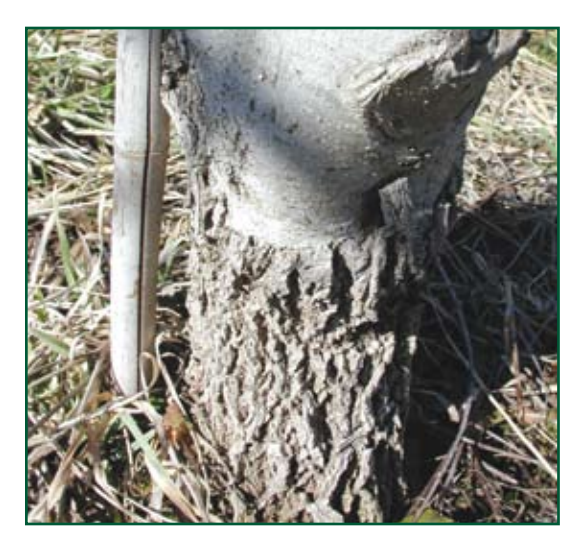
Figure 7. Graft union between rootstock (with rough bark) and selected scion. The rootstock and scion are genetically different, but function together as one tree. This grafted tree is three vears old.

Grafted trees. Branches (scions) from selected trees are usually grafted onto 1-0 bare-root seedling rootstocks and then sold a year or two later as grafted trees (Fig. 7). Nurseries can produce genetically identical copies of a desirable tree by grafting. Although the shoots of grafted trees may be perfect genetic copies (clones) of the original donor tree, different grafted trees of the same clone can perform differently because of the effect of the rootstock and differences in the environments in which they are planted. Errors in the propagation and labeling of grafted trees can be difficult to detect, so the quality of grafted trees depends on the skill of the grafter and the care taken in growing the graft and maintaining