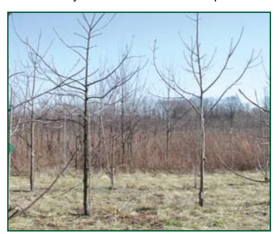
Figure 9. Vigorous, three-year-old inter-specific walnut hybrids growing in central Indiana.

Hybrid trees. What about hybrid walnuts? Hybrid seed corn has been such a spectacular success that people sometimes mistakenly use the word "hybrid" to mean having superb genetics and performance. Hybrids are crosses between two plants that are genetically different. By this definition, almost every hardwood tree is, technically, a hybrid. The word hybrid is also used by tree breeders in a special sense to mean trees that are the offspring of a cross between different species (interspecific hybrids). Tree breeders have discovered that by crossing members of different but closely-related species they can produce offspring that have a mix of characteristics of both species (Fig. 9). Interspecific hybrid seedlings are are extremely variable. Some have exceptional