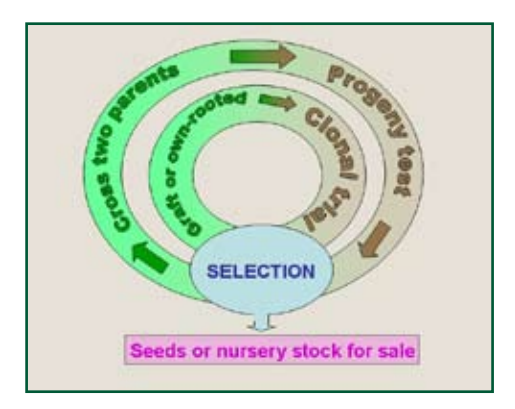
Figure 3. Flow chart showing cyclic nature of tree improvement; blue=selection, green=breeding, brown=testing, pink=deployment to landowners.

Is it genetics or the environment? Much of the time and cost of a tree breeding program is devoted to understanding the separate effects of environment and genetics on tree performance. A tree in a forest or plantation that has a superior appearance may or may not have superior genetics, and the genetic quality of a tree cannot be judged by appearance only. Not all traits are