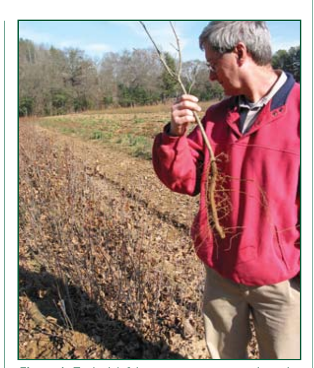
Figure 1. Typical 1-0 bare-root nursery stock ready for planting.

Consumers who purchase hardwood seeds, seedlings, own-rooted trees, or grafted stock from public agencies or private vendors are protected by the prevailing consumer protection legislation in their state, by any contracts or warranties that may be offered at the time of sale, and by other provisions of state law such as licensing requirements. If consumers purchase nursery or seed stock from a state other than the one in which they reside, they may also be protected by certain federal statutes and codes. The propagation and sale of some nursery stock may be protected by trademark or patent laws, but these laws affect nurseries more