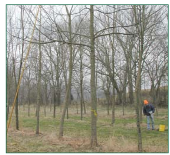
Figure 5. A forester has selected the tree right of center and flagged it with a yellow ribbon. The tree's shape was the result of genetics interacting with environment. This selection will be progeny tested to see if the seedlings inherit excellent growth rate and form.

Own-rooted trees. Own-rooted trees, sometimes called simply "rooted" trees, are genetic