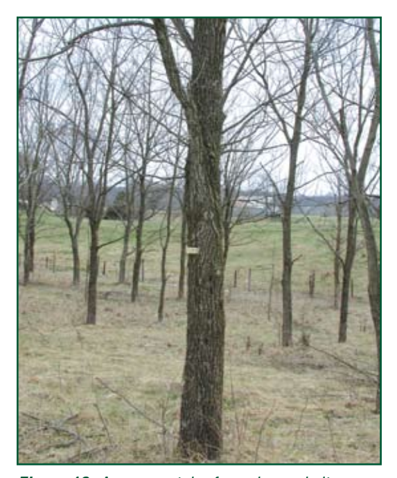
Figure 10. A poor match of species and site. These 30-year-old black walnut trees will never reach their potential because the soil on this site limits their growth.

Together. Without active management, the money spent on improved trees is wasted. The performance of improved trees will depend to a great extent on their management and the quality of the growing site as described above. Outstanding site quality and management will never yield the maximum return unless trees of the best genetic quality are used, yet good genetics cannot compensate for neglectful management or poor site quality. Every landowner must decide if the