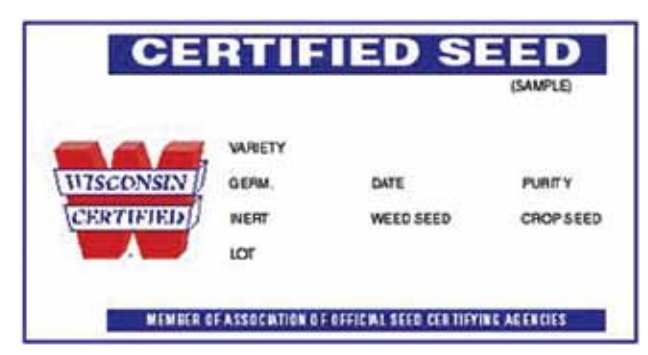
Figure 2. Tag for seed certified by Wisconsin Certified Seed Association.

containers bearing official certification tags (Fig. 2). The tags identify the certifying agency, and they also indicate to which of three classes the seeds or seedlings belong; seeds can be source-identified , select , or certified . In general, only certified seed is from trees with proven genetic superiority, but the details of certification vary from state to state. For details, consult with the certifying agency in your state (Appendix 1). Seeds sold without this type of certification are not covered by legal guarantees of genetic quality or performance.