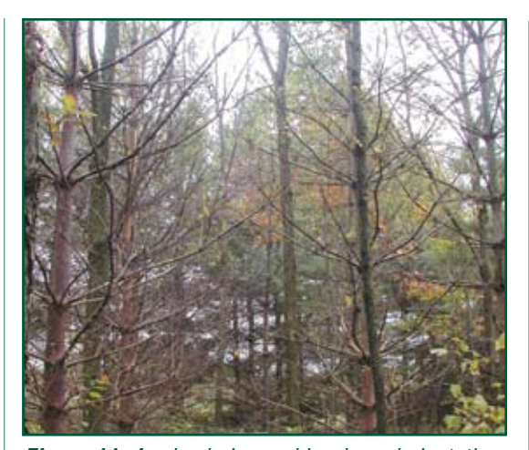
Figure 11. A mixed pine and hardwood plantation being managed for hardwood timber production. The landowner and forester have matched the type of planting stock to the landowner's needs and management budget.

Tree breeders share landowners' optimism by working to make sure that even the "average" trees of this generation are a little better than the average tree available 20 years ago. By understanding the methods and terminology of tree improvement, landowners can make informed decisions about what to expect from advertised products and whether they are a good value.