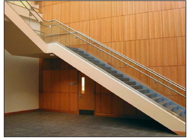
Figure 16. Cherry paneling in a public building. In high end applications the sheets could run the entire height of the room and be consecutively matched from one side to the other.

are preferred. Flitches are often individually selected by the architect or designer.