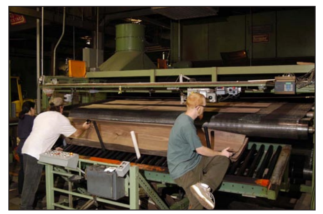
Figure 13. Outfeed end of veneer drier. Each sheet of veneer is still in the order of which it was originally sliced. Sample sheets are pulled from each flitch at this point. The moisture content of the veneer is being checked by the person in the middle.