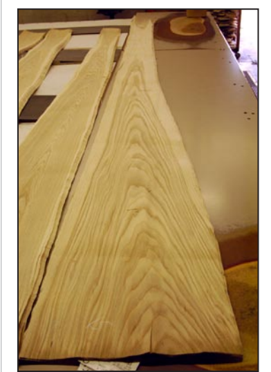
Figure 8. "U" or "V" shaped grain pattern typical of flat sliced veneer. The species is white oak.

The way a flitch is sliced is affected by the species and the grain pattern desired. For most species, the log is simply cut into halves. Each half is then sliced from the outside of the log to the very center. As the slicing operation proceeds deeper into the half log, the grain pattern changes significantly. A V- to U-shaped cathedral pattern is produced on the outside (Fig. 8). As the process continues and the direction of the cut to the annual growth rings changes, the cathedral effect is lost, and a straighter, less showy grain pattern develops. The veneer sheets are all kept in sequenced order from beginning to end. This allows matching of veneers to provide a decorative affect.