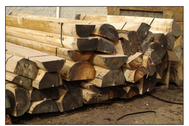
Figure 3. The flitches are banded on the ends to prevent splitting and heated in vats to soften the wood.