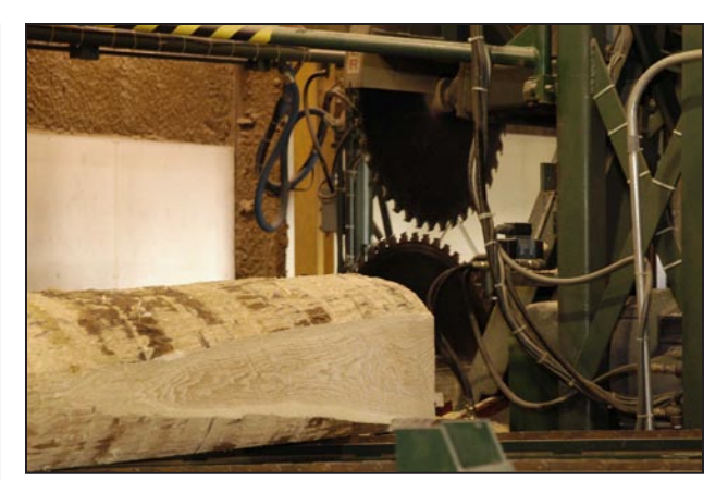
Figure 2. Circular head saw and top saw used to flitch logs for veneering. Band saws are also commonly used. In the simplest process, two opposite faces of the logs are lightly slabbed. The log is then cut through the middle producing two flitches for slicing into veneer.

Flat slicing is the method used to produce decorative face veneer. Face veneer is applied to the exposed surface of the panel. It must be aesthetically pleasing and is usually of the highest quality. This veneer is produced by first cutting the log in halves or quarters (Fig. 2), or sometimes other proportions, each piece being called a "flitch" (Fig. 3). The flitches are specially cut from the log to produce specific grain patterns. The flitches are heated in water vats (Fig. 4) to soften the wood, making it easier to slice or cut. Heating or cooking schedules are dependent upon species and may vary by manufacturer.