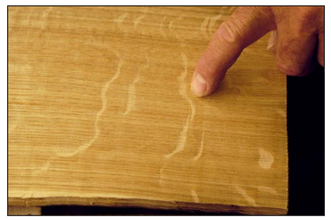
Figure 9. Quartered pattern showing ray flecks in white oak veneer.

With oak, the log may be sawed into true quarters and the veneer sliced parallel to the wood rays. The rays appear as large shiny splotches. This wood is said to be "quartered" and in (Figure 9 shows an example). The log may also be processed in such a way that the veneer knife intersects the wood rays at a 45° angle.