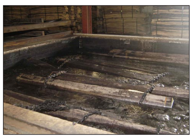
Figure 4. Veneer flitches being heated in hot water to soften the wood.