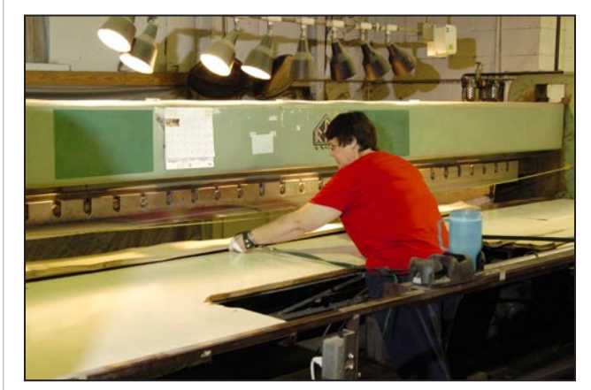
Figure 14. Guillotine used for clipping the edges of veneer and also for removing major defects. A second machine is usually used for end clipping as well as defect removal. Note the safety device used to prevent the operator from accidentally over extending his or her reach. The machines are usually equipped with lasers to show exactly where the cut will be.

As each sheet of veneer is sliced from the flitch, it is kept in order. This enables the flitch to be laid out and used one sheet at a time for producing panels or other products where a repeating grain pattern is desired. For domestic veneer, three sample sheets of veneer are generally "pulled" from each flitch. These samples are located near the outer 1/3, middle, and inner 1/3 of the flitch and should represent the overall quality to a prospective customer. More sample sheets may be pulled on larger