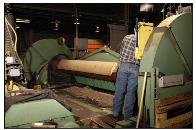
Figure 11. Half-round veneer slicing machine.

The third way in which hardwood logs are cut into veneer is on a half-round machine (Fig. 11). With this method, a half log or flitch is dogged or secured in place and turned 360° against a stationary knife. As a result the log is cut somewhat – but not completely – along the circumference.