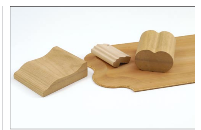
Figure 17. New technologies in using veneer have extended the resource substantially. Pictured here is veneer wrapped on a reconstituted wood product and used as molding. A veneered raised panel door is also shown.

medium-density fiberboard. The veneer is then glued or wrapped to the contour of the molding. This product is an excellent substitute for solid wood moulding. Veneer for this application must yield long clear cuttings of at least six feet. These pieces are then jointed together and glued to a backer sheet and wrapped into long rolls for the customer.