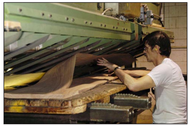
Figure 12. Infeed end of a veneer drier. A vacuum is used to help assist the operator in lifting each sheet into the drier. The driers are usually a 125 to 150 feet long.

After the veneer is sliced, it is generally dried to a 7-12 percent moisture content for domestic use and 12-18 percent for the export market (Figs. 12, 13). Over drying will make the veneer brittle and hard to handle without causing damage. Buckle also increases as the moisture content is reduced. For the domestic market, the ends of the veneer are clipped, and light edge clipping may also occur (Fig. 14). The square footage of veneer in each flitch is measured for pricing purposes. With large or exceptional logs, which contain two or more flitches, the flitches are often numbered consecutively so they can be kept together and sold as one lot. The veneer is then bundled in crates, ready for shipment on the domestic market