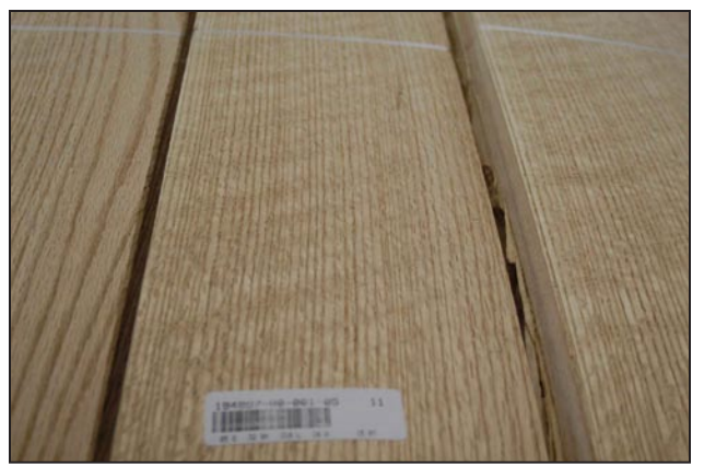
Figure 10. Rift cut veneer from white oak.

With equipment improvement, veneer thicknesses have decreased or become thinner over the years thus, extending the resource. Veneer thickness generally ranges from 1/36 to 1/50 of an inch. The thinner or 1/50 inch