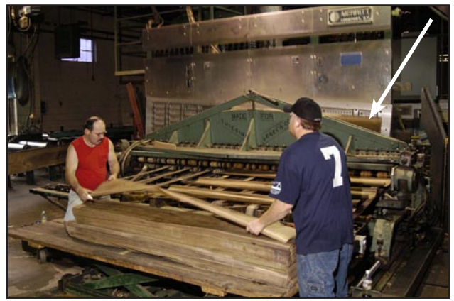
Figure 5. After cleaning, the flitches are sliced into veneer. The flitch (upper right corner) is dogged and moved up and down against a stationary knife. The resulting sheets of veneer are stacked in order.

After heating, the flitches are cleaned and brought to the slicing machine (Figs. 5, 6). The flitch is then held by hydraulic dogs and or vacuumed (dogged) in place on a metal frame, which moves down against a knife, and a thin sheet of veneer is "sliced" loose. After all slicing