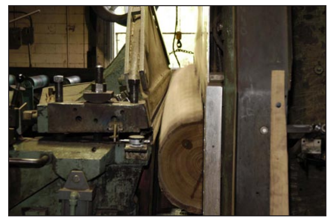
Figure 6. End view of a flitch being moved down against a stationary knife.

is completed, the remaining piece is called a backing board. The newer vacuum process results in a thinner backing board and a higher quality veneer. It is generally used to slice the more expensive species. The backing board will be about <sup>1</sup>/<sub>4</sub> inch thick and can be used for