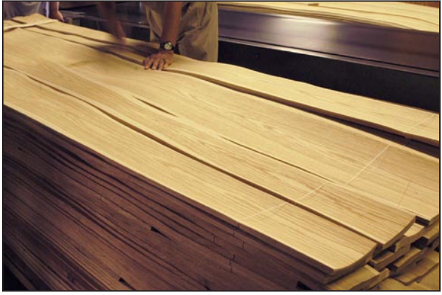
Figure 15. High quality white oak veneer prepared for the export market. Rough edges, ends, and other major defects have been removed.

For the export market, the rough or waney edges along the lengths as well as the ends and any other major defects in the sheets are clipped before measuring and packaging into bundles of 24 sheets each (32 sheets for quarters) (Fig. 15). Each flitch is still kept together.