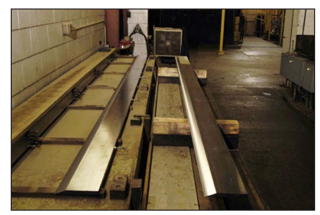
Figure 7. Knives used for slicing veneer are razor sharp.

flooring, pallet liners, drawers sides or other applications. The veneer knife may be up to 18 feet long (Fig. 7).