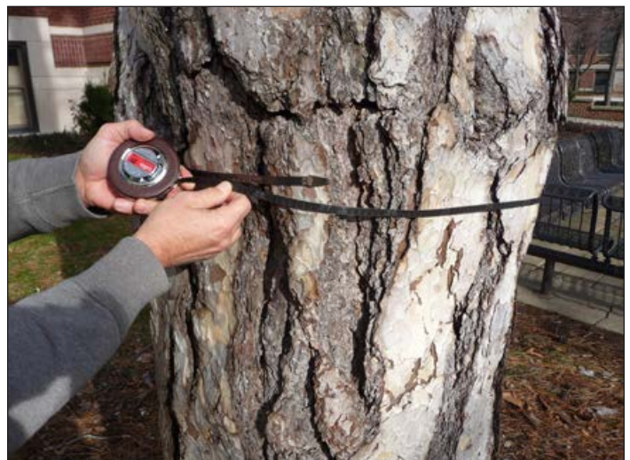
A diameter tape aids in calculating tree size.

The location factor involves the landscape value of the site and the placement of the tree on the property. Consider the location of the property, overall quality of the landscape, hardscape and related elements. Understand the tree's contribution to the site, its function and the aesthetics to determine how effectively the placement of the tree provides these benefits.