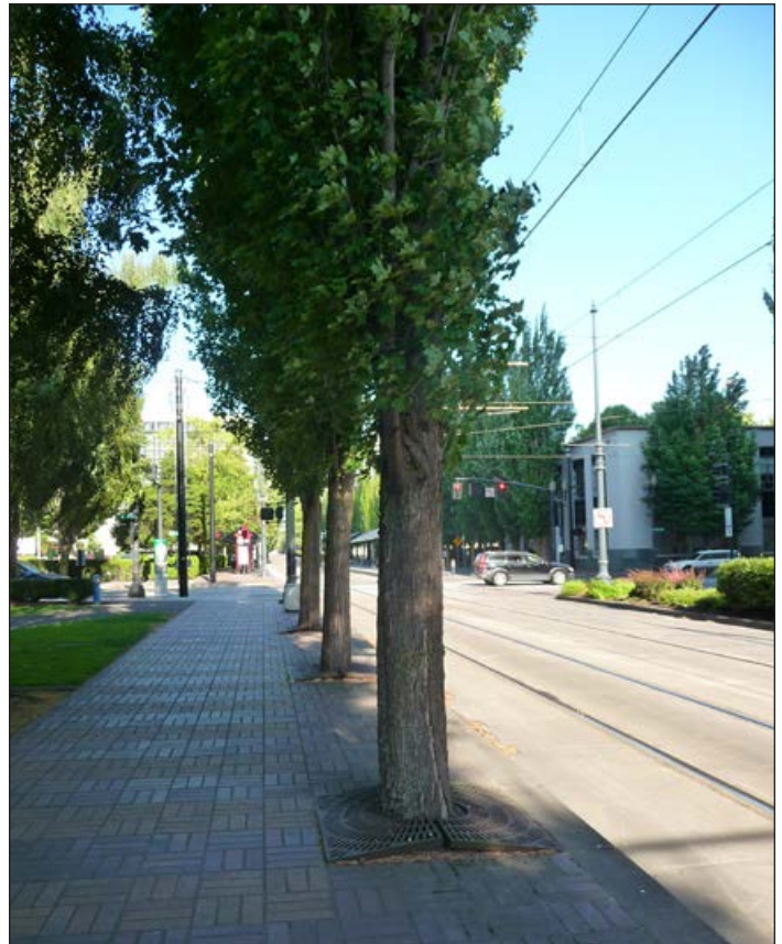
Location is one factor in determining a tree's value.

The species rating is a comparative value given to the tree or plant based upon its individual characteristics. Consideration is given to the plant's assets and its inherent qualities. This rating is provided by a council of experts in the area and will vary within regions around the country. Additionally, there can be variations in ratings within the state, relative to hardiness zones. Adjustments will be necessary based on subjective observation. Check the local chapter of the International Society of Arboriculture for more information on the ratings for your state.