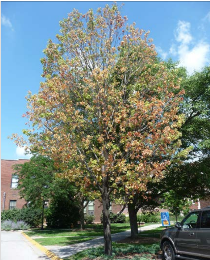
Tree condition or health is an important rating determination.