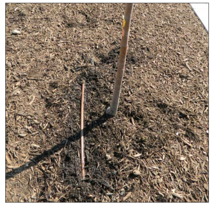
Drip irrigation delivers water on a timed basis.

Do not operate a drip irrigation system without a timer or without understanding water output. It is not possible to gauge the moisture content of the soil ball by observing the wetting of the soil surface. If the soil ball gets too wet and has inadequate drainage, disease problems will arise.