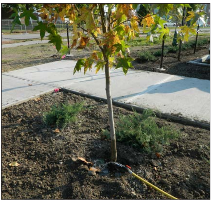
Water trees whenever rainfall is insufficient.

that trees have adequate moisture to survive the winter months and are ready for spring growth. Nighttime irrigation is optimal, as this is when the tree is physiologically catching up with the water loss during the hot daytime temperatures.