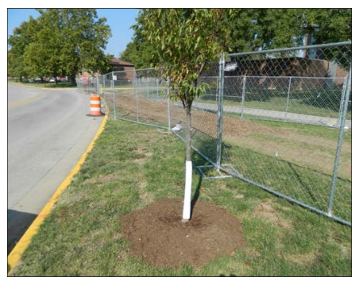
Mulch and trunk protection helps with moisture loss and damage.

• Mulch trees! Never has there been a more compelling reason to maintain adequate levels of mulch than during periods of drought. Use organic mulch such as clean woodchips and apply to a depth of 2 to 3 inches around the plant root zone. Be sure to replenish throughout the year as the mulch decomposes or is displaced. This will help reduce moisture loss through evaporation and moderate soil temperatures.