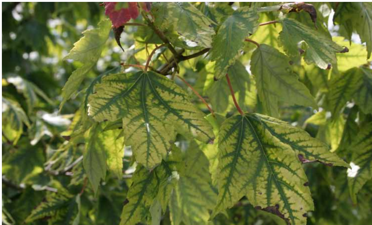
Figure 2. Severe interveinal chlorosis on leaves is a typical symptom of a micronutrient deficiency caused by high-pH soils.

portable field-ready meters. A pH meter consists of a glass electrode that changes its voltage output in response to the pH of the solution in which it is immersed. The instrument compares the changed output to the constant voltage of a reference electrode that is calibrated with solutions of known pH values.