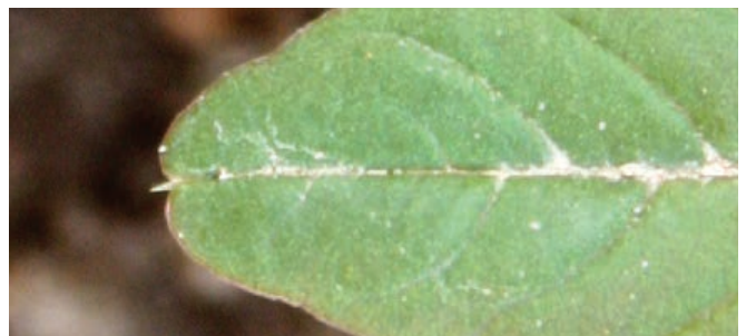
Figure 13. Some Palmer amaranth plants have a single hair in the leaf tip notch.