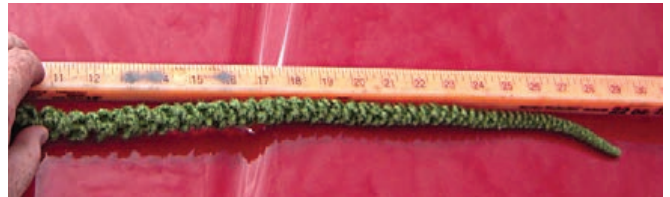
Figure 11. A Palmer amaranth seed head measuring close to 30 inches long.