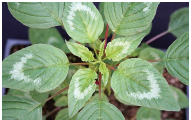
Figure 12. Some Palmer amaranth leaves have white chevron or V-shaped watermarks.