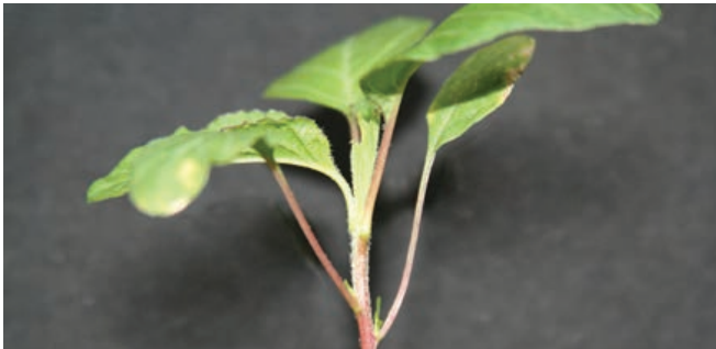
Figure 1. Redroot and smooth pigweeds have hairs on their stems and leaf surfaces. These hairs distinguish them from common waterhemp and Palmer amaranth.

Only redroot and smooth pigweeds have hairs (pubescence) on their stems and leaf surfaces (Figure 1). The fine hairs will be most noticeable on the stems towards the newest growth. Palmer amaranth and common waterhemp do not have hair on any surface. Looking for pubescence is a quick and easy way to differentiate redroot and smooth pigweeds from the other two amaranths.