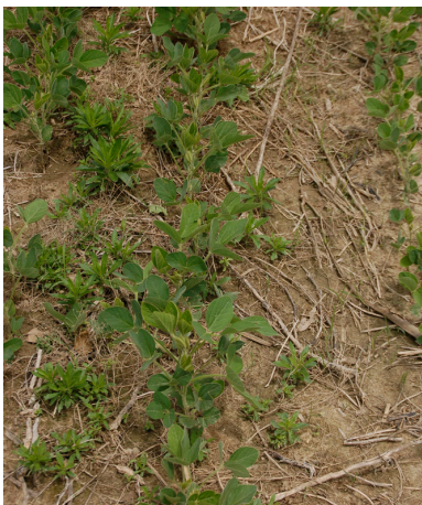
Left photo - spring application of glyphosate + 2,4-D + residual herbicides (no fall herbicide treatment)

Maybe - but this is not an approach that has consistently worked well (see photos below). It can be difficult to accomplish unless the marestail population in the field has been well managed for several years and the population is generally low. Growers should use their own previous experiences here as guidance, and plan on increasing the complexity and rates of the herbicide program. Problems with skipping the fall treatment, and applying everything at once in spring include the following: 1) applying early in spring when plants are small can result in poor control of plants that are emerging in mid-season if the residual herbicide runs out; and 2) applying closer to planting to maximize the length of residual often results in less effective control of larger, older marestail plants, especially those that have overwintered.