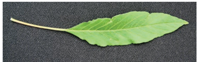
Figure 4. The linear, lance-shaped leaf blade and short petiole characteristic of common waterhemp.