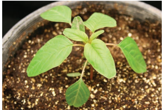
Figure 7. Young Palmer amaranth seedlings exhibit an extended petiole on the first true leaves.