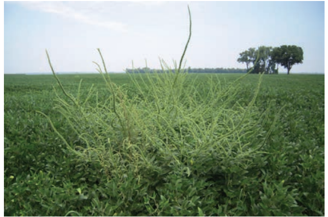
Figure 10. A Palmer amaranth plant growing in soybean with multiple terminal seed heads.

The presence of stiff, pointy bracts on the female seed head and leaf axils can lead to confusing Palmer amaranth with spiny amaranth or spiny pigweed ( Amaranthus spinosus ). Spiny amaranth is predominantly a weed of pastures, livestock holding pens, and feeding areas; it is rare in agronomic fields. Spiny amaranth has a bushy growth pattern and exhibits the spiny bracts throughout its life cycle, whereas Palmer amaranth exhibits the bracts only at maturity and during reproductive stages.