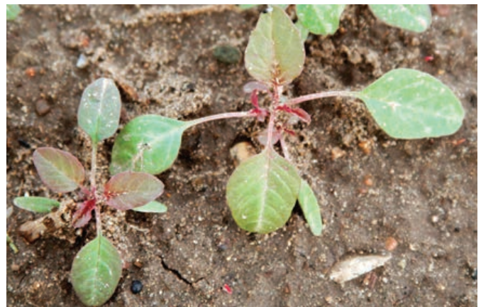
Figure 8. A Palmer amaranth seedling. Note the extended petiole on the first true leaves.