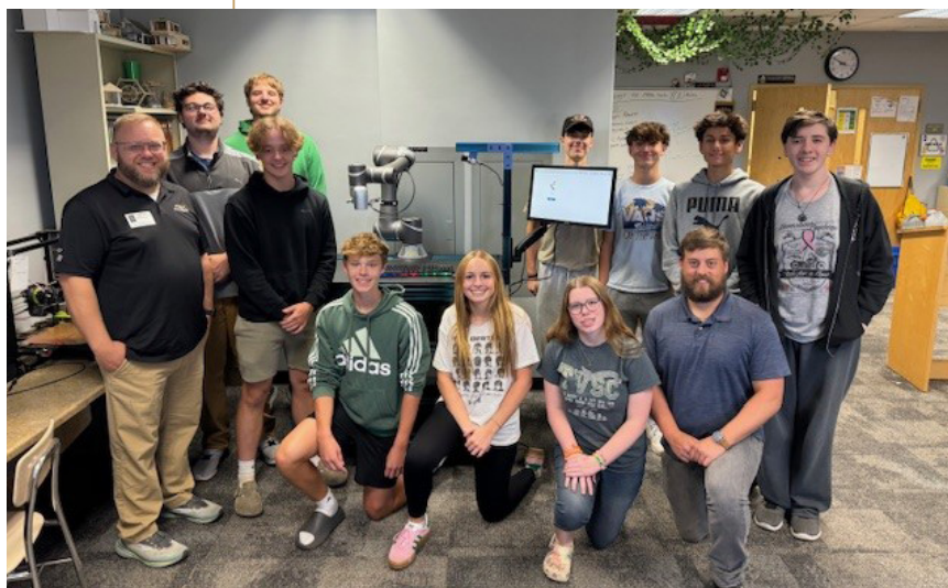
Top left: Cobot in a classroom; Top right: Snack lesson at Central Noble Middle School; Bottom: Cobot in Kosciusko County

from Vincennes University and Telamon Robotics to bring three collaborative robots (cobots) to use in schools and 4-H programs for workforce development in Elkhart, Kosciusko, and Whitley Counties.