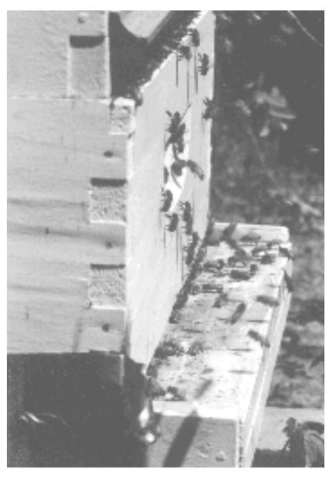
Figure 1. Bees and hive