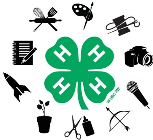
EXHIBIT HALL PROJECTS