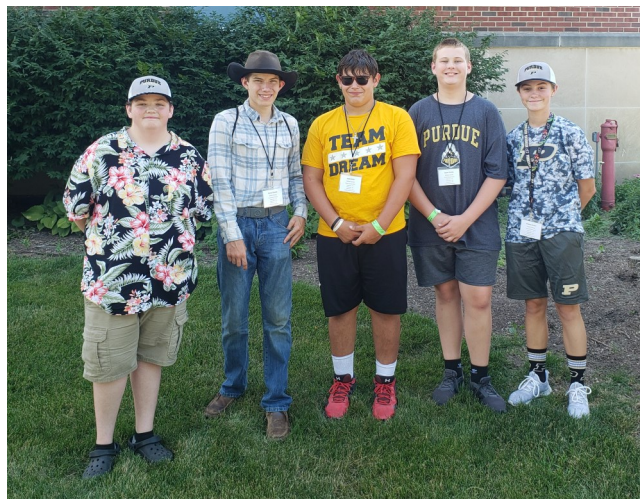
2022 Sullivan Co. 4-H Round Up Delegates

Today, Sullivan County has over 400 4-Hers and 80 volunteers that help our program be successful year round. In addition to the county fair, 4-Hers have the opportunity to go to 4-H Camp, participate in Performing Arts and other area contests, travel to Purdue University's campus to learn about careers and meet 4-Hers from across the state, and they continue to be involved with local 4-H Community clubs.