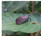
Figure 3: Adult spotted Lanternfly, Photo: John Woodmansee