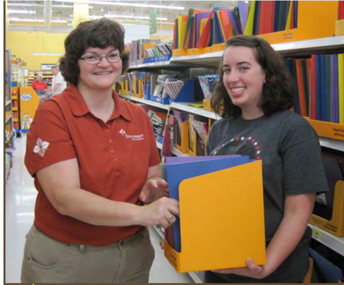
"I'm glad we are able to do this for the kids that really need it." - Youth Participant