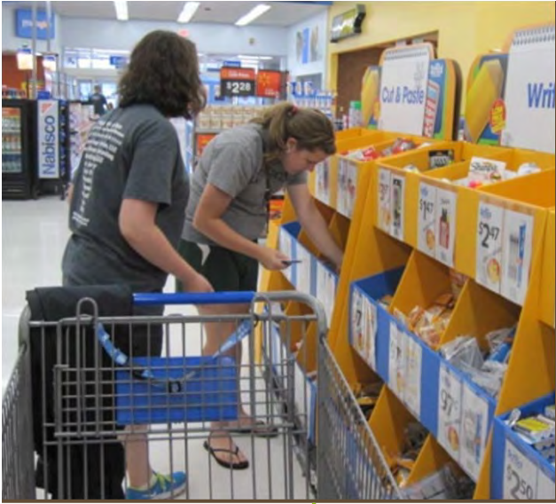
"You have no idea how much this is going to help the children and their families." - Community Member