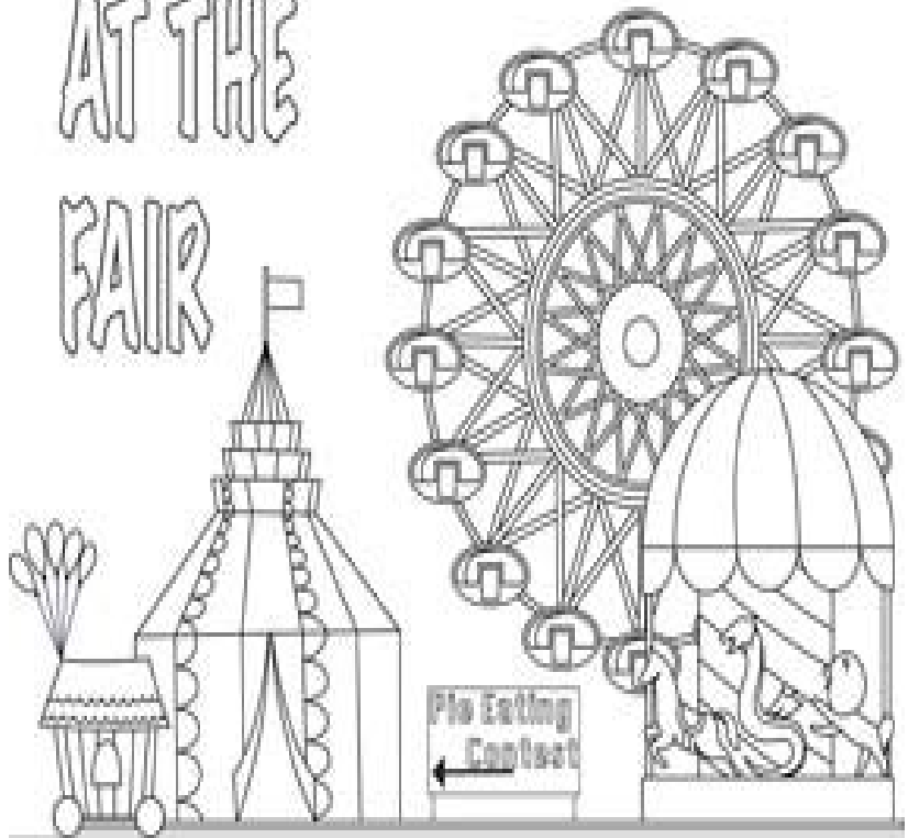
Children's Edition Ages 6 to 8