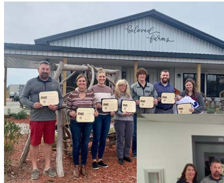
LEADERSHIP Spencer County "A Tradition of Growing Leaders"

Purdue Extension began a partnership with Leadership Spencer County in 2019. The second class of the revamped and enhanced program completed in November 2021 with 8 graduates. Sessions were held monthly at locations throughout Spencer County with facilitated sessions and activities on a variety of personal and professional leadership development topics . Upon completion, participants are encouraged to become more involved in the community and take on leadership roles, both professionally and civically . The 2021 class chose mapping Spencer County hiking/biking trails on the "All Trials" app as their class project.